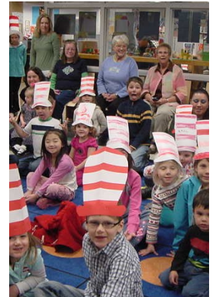
Read Across America Dr. Seuss' Birthday