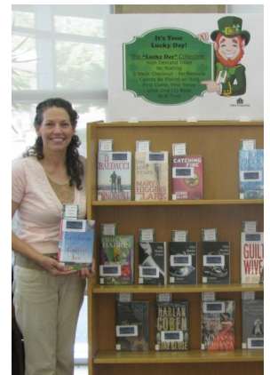
Lucky Day Collection