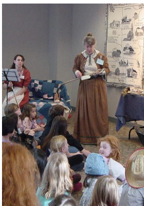
Laura Ingalls Wilder's Birthday Party