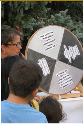
National Night Out, Lanyon Park "Rueda de Biblioteca"