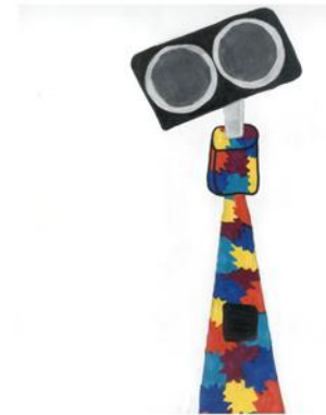
Bibli our ASD Robot